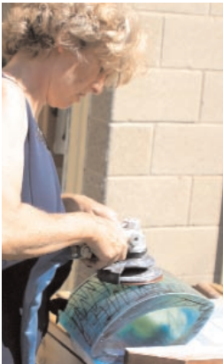
Recipient of the "2007 Irving S. Gilmore Emerging Artist" grant